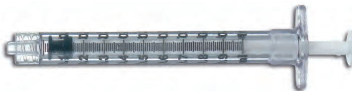
Example of a Luer connector in a syringe.