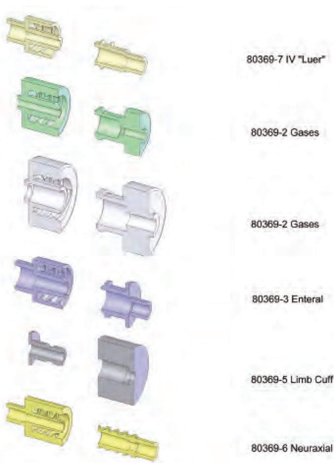
Examples of the connector designs that the CAD team created using 3D modeling and presented to the joint working group.